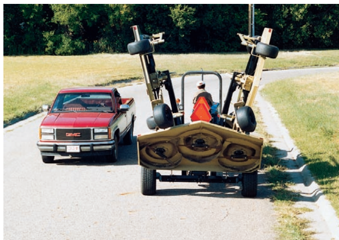
Transport width of 9'6" allows for safe transport from site to site.